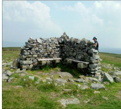
Mystery picture. Last month's was the interior of Wensley church. Where is this?

Come along and find out more by sharing in this unique informal service.