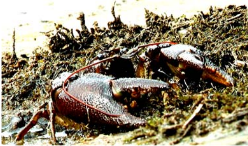
A crayfish exposed during the work

The good news is that work did finally start on the river restoration project on Marsett Bottoms, the bad news is that after just a few days water levels rose and work had to be abandoned until levels fall again. However a considerable amount of stone has already been removed and been used to improve the track close to Marsett. It is no longer the ankle-twisting route that it was so access to Low Mill's bunk barn is much improved, which is important as the barn was designed to accommodate those less physically able.